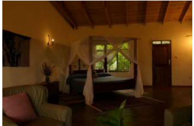
Ngorongoro Farm House, Tanzania