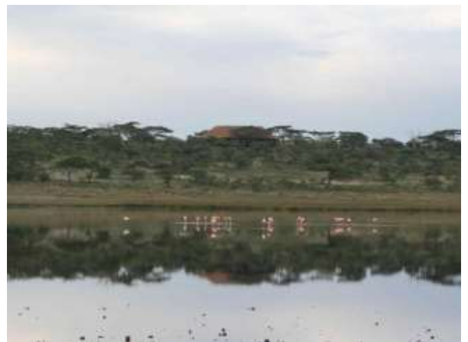
Lake Masek Tented Camp, Tanzania