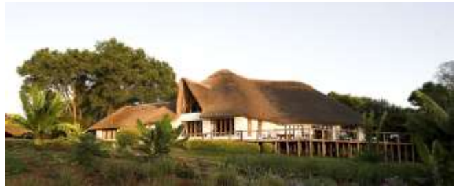
Ngorongoro Farm House, Tanzania