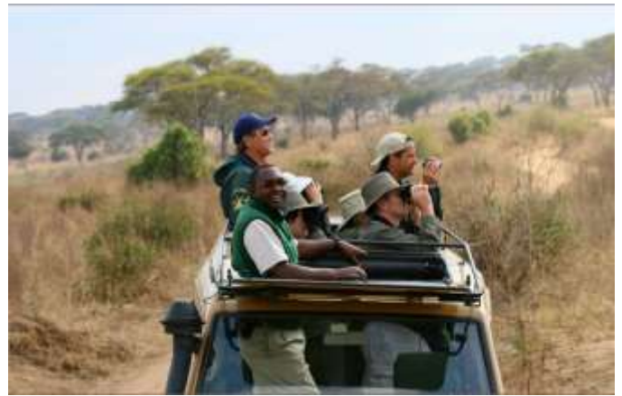
Serengeti - Tanzania