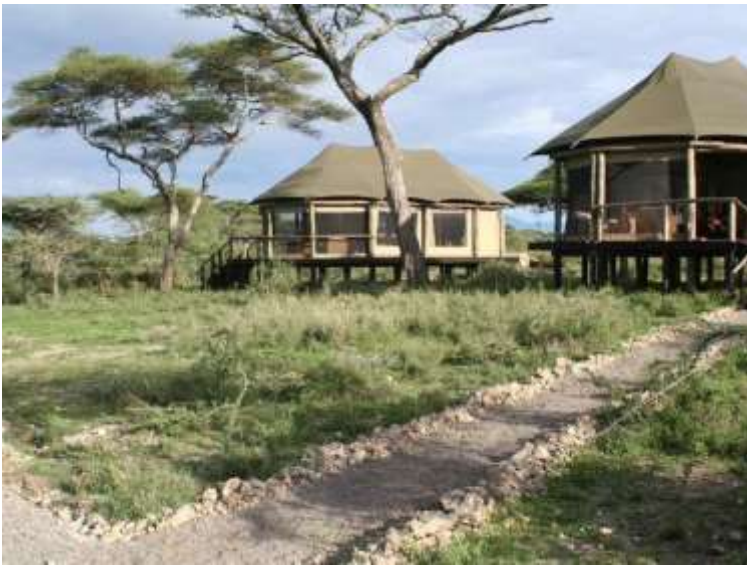
Lake Masek Tented Camp, Tanzania

After breakfast, we will take a bush walk along the banks of Lake Masek with a ranger. No telling what we might see for there is abundant game around camp and Lake Masek, including the Big Five . Later on, after lunch, we will then take an afternoon game drive which will end right before dark. We will then head back to camp, relax around the fire to talk about our day, and then head to our tents to get cleaned up for dinner.