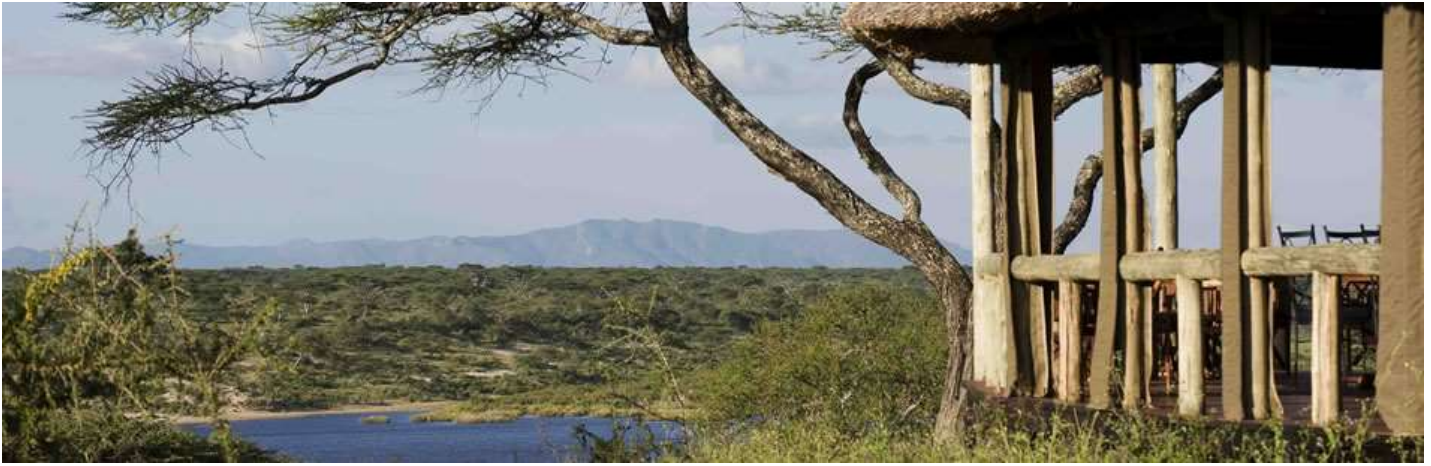
Lake Masek Tented Camp, Tanzania