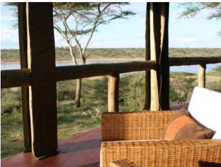
Lake Masek Tented Camp, Tanzania