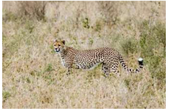
Serengeti - Tanzania