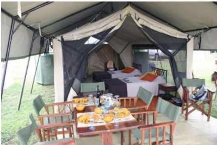
Kati Kati Tented Camp, Tanzania