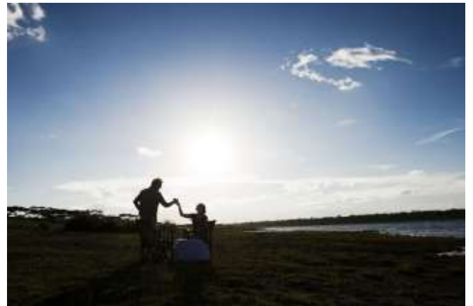
Lake Masek Tented Camp, Tanzania