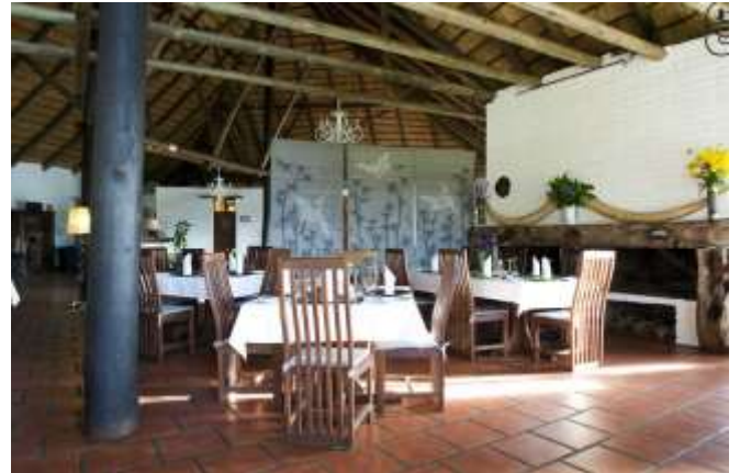
Ngorongoro Farm House, Tanzania