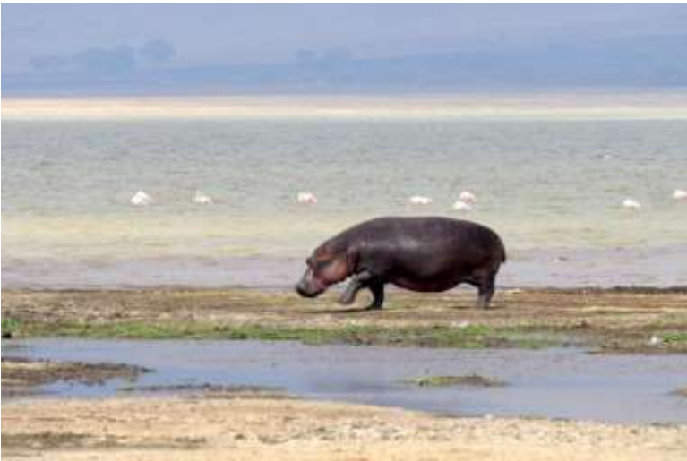
Serengeti - Tanzania