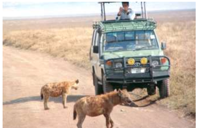
Serengeti - Tanzania