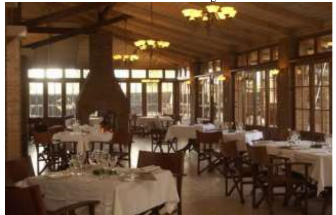
Arusha Coffee Lodge