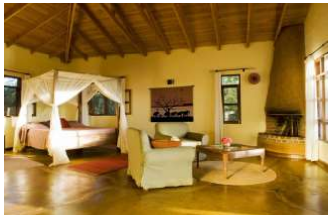
Ngorongoro Farm House, Tanzania