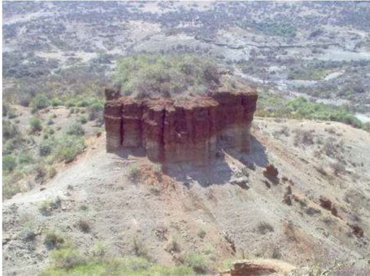
Olduvai Gorge, Tanzania