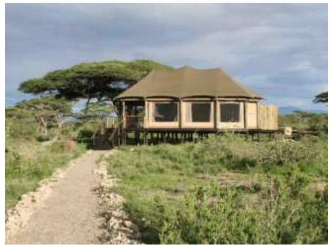
Lake Masek Tented Camp, Tanzania