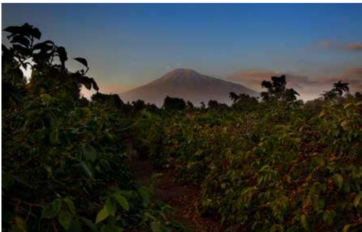
Arusha Coffee Lodge