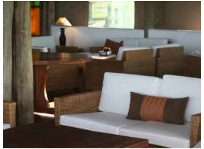
Lake Masek Tented Camp, Tanzania

After breakfast, we will take a bush walk along the banks of Lake Masek with a ranger. No telling what we might see for there is abundant game around camp and Lake Masek, including the Big Five . Later on, after lunch, we will then take an afternoon game drive which will end right before dark. We will then head back to camp, relax around the fire to talk about our day, and then head to our tents to get cleaned up for dinner.