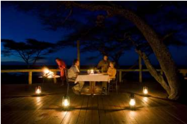
Lake Masek Tented Camp, Tanzania