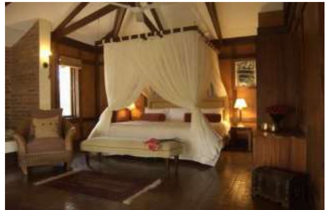
Arusha Coffee Lodge