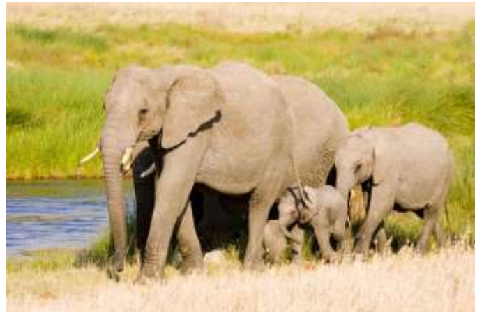
Serengeti - Tanzania