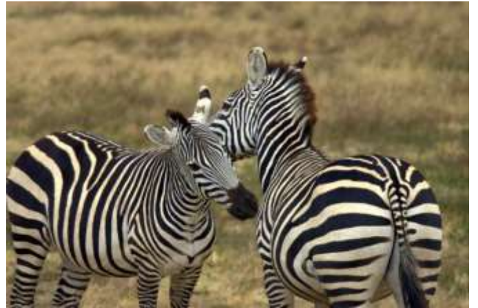
Serengeti - Tanzania