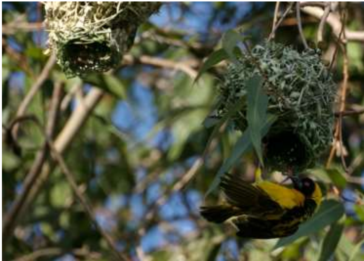
Ngorongoro Farm House, Tanzania