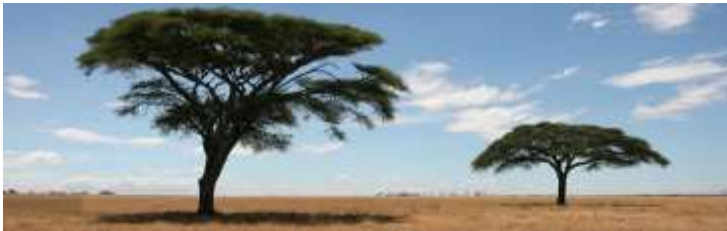
Kati Kati Tented Camp, Tanzania