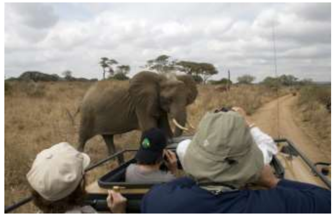
Serengeti - Tanzania