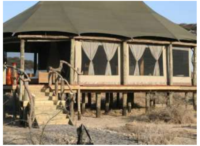
Lake Masek Tented Camp, Tanzania