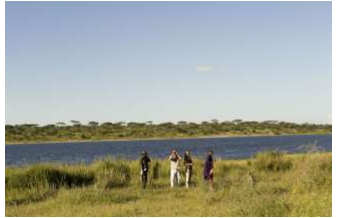
Lake Masek Tented Camp, Tanzania