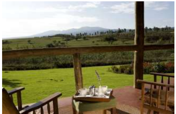
Ngorongoro Farm House, Tanzania