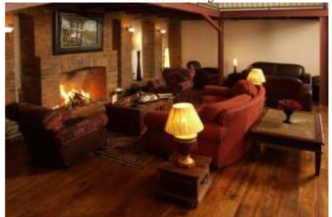
Arusha Coffee Lodge