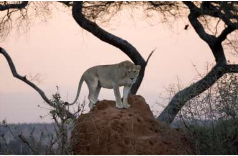
Serengeti - Tanzania