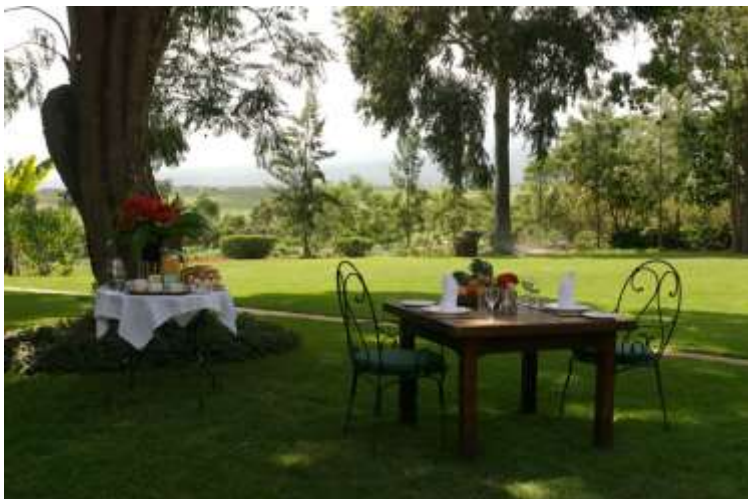
Ngorongoro Farm House, Tanzania