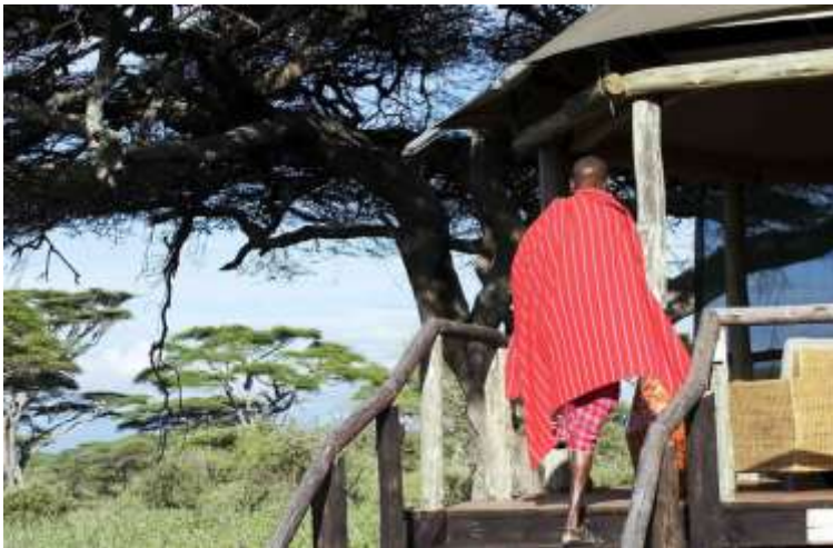
Lake Masek Tented Camp, Tanzania