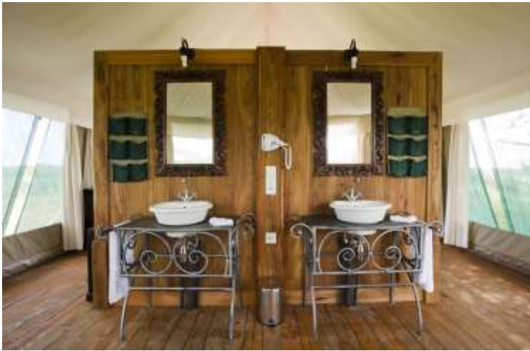
Lake Masek Tented Camp, Tanzania