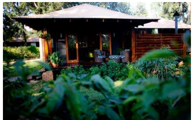
Arusha Coffee Lodge