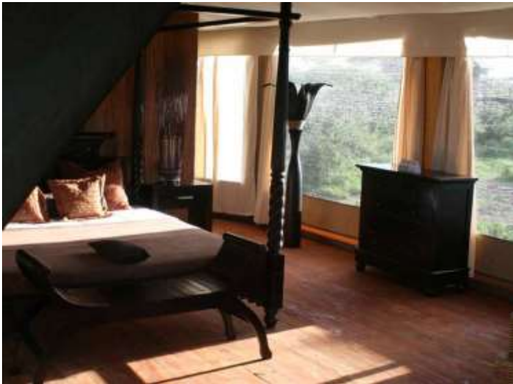
Lake Masek Tented Camp, Tanzania