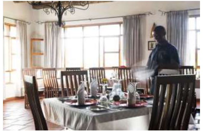
Ngorongoro Farm House, Tanzania