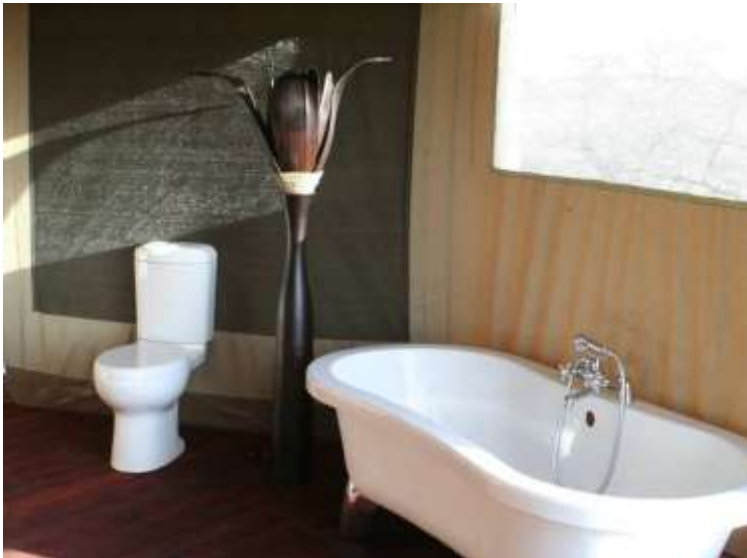
Lake Masek Tented Camp, Tanzania

After breakfast, we make our way to Lake Masek Tented Camp which is located by the shores of Lake Masek in Ndutu, situated between the vast plains of the Serengeti National Park and the northwest side of Ngorongoro Conservation Area. The camp consists of 20 permanent tents which are built on raised platforms. The interiors are comfortable with large beds, traditional wooden furniture, and attractive furnishings. Each tent has an ensuite bathroom with flush toilet, shower, and a freestanding bath. At the front of each tent is a covered verandah which is open-sided so you can relax and enjoy the lake views.